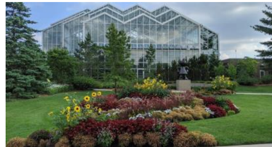
Meijer Gardens

After breakfast, head to the Frederik Meijer Gardens and Sculpture Park , where you will enjoy a narrated tram tour and, as a special treat, a guided tour of the Japanese Gardens . Spend some time walking around the gardens and shopping, with a special gift from the gift shop included! Enjoy lunch on your own in the spacious café. Next, board the Grand Lady for a leisurely two hour evening music cruise . End the day with happy hour and dinner at one of the restaurants located in or near the hotel.