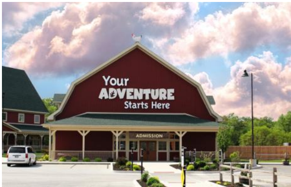
Fair Oaks Farm

Enjoy a hot breakfast buffet before heading out to spend the day on the farm. Tour the pork and dairy areas and learn what this Indiana research farm is all about. Return to The Farmhouse for lunch, then head on to Michigan, where your first stop will be a tour of the Kellogg Manor House and dinner there. Check into the Embassy Suites in Downtown Grand Rapids , which will be your home for the next three nights. Embassy Suites offers happy hour and full hot breakfasts daily.