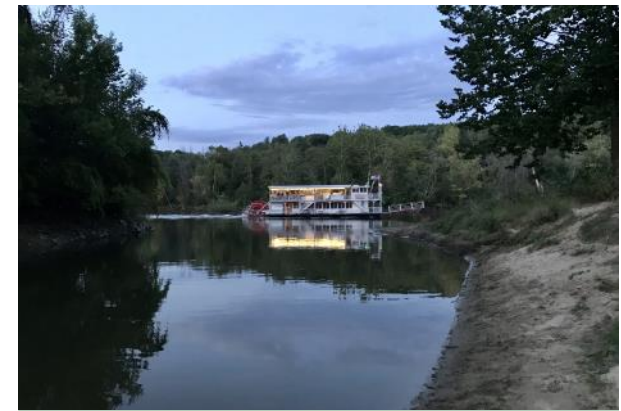
The Grand Lady, Grand Rapids, Michigan

Please note: This itinerary may be subject to change as we finalize the details, and additional stops may be added. A finalized itinerary and detailed travel instructions will be mailed to each traveler around one month prior to the trip.